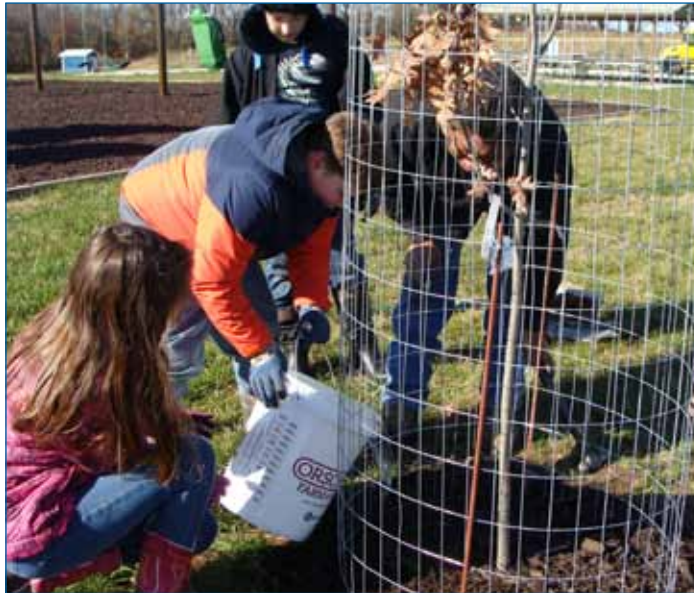
Students water one of the trees they helped plant.

Though cool and a bit breezy, the youngsters enthusiastically helped set the trees in the holes, backfill dirt, mulch, water, and erect protective fencing around three trees around the playground in the RV camping area. After the work was done, each one completed an adoption paper giving their tree a name and recording important information about its size and description.