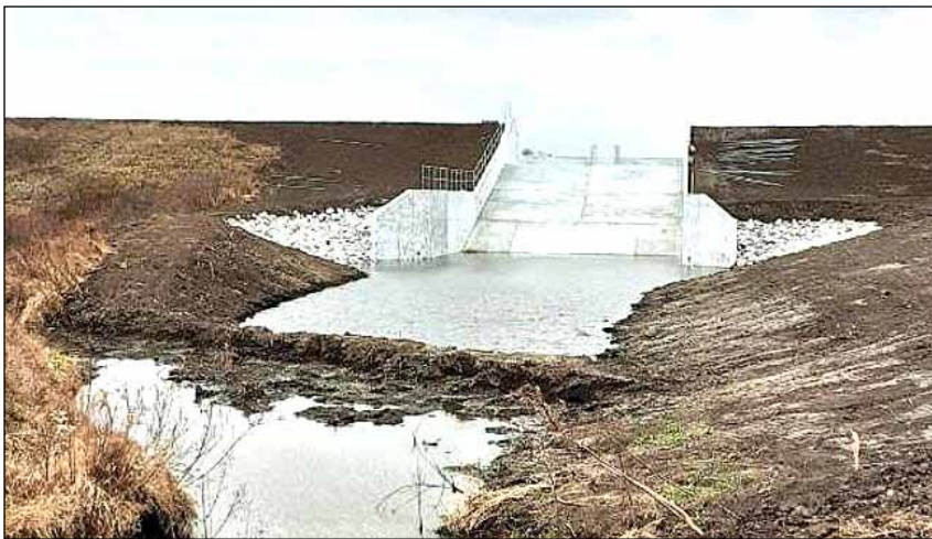
Seeding remains to be done around the newly constructed concrete spillway through the dam at UBN 25-C.