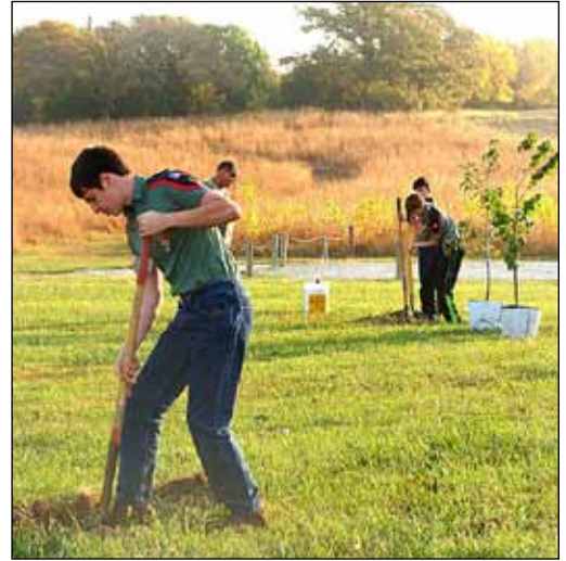
Three members of the Trail Life USA Troop 812 help plant two of the trees in the east fishing access area at Duck Creek Recreation Area.

some adults might have appreciated the steel slides and other Leave it to Beaver era equipment they enjoyed using as a child, Table Rock's generous donation will allow the NRD to upgrade to more modern playsets.