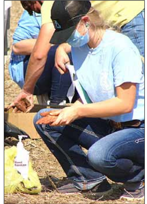
Face coverings and hand sanitizer were common components of this year's Area Land Judging Contests.

Though not your typical contest, the weather was ideal; and both students and adults enjoyed the opportunity to participate. Thanks to everyone who helped make this event possible.