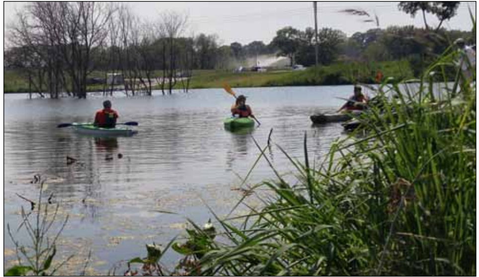
Kayakers take advantage of the serene water at Duck Creek during a recent kayak safety day.

Kirkman's Cove was placed on health alert for blue-green algae for a brief period in June. A wind storm that came through the Humboldt area in June resulted in tree damage throughout the park as well as to the park entrance sign. Over the next year two of the old, wooden