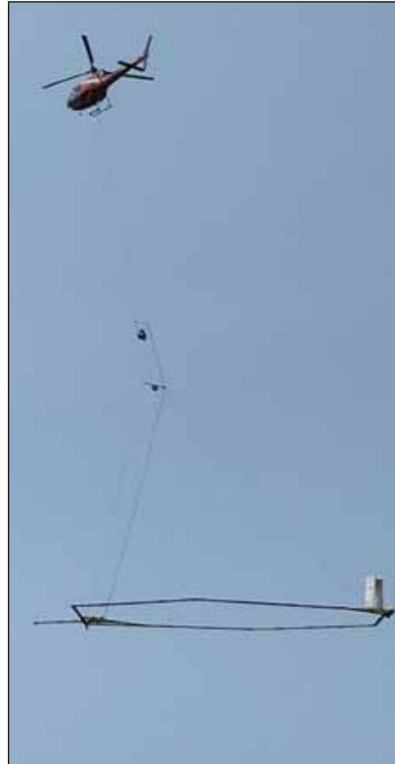
An AEM flight takes off in June to collect underground data.

Additional information may be found online at www.enwra.org