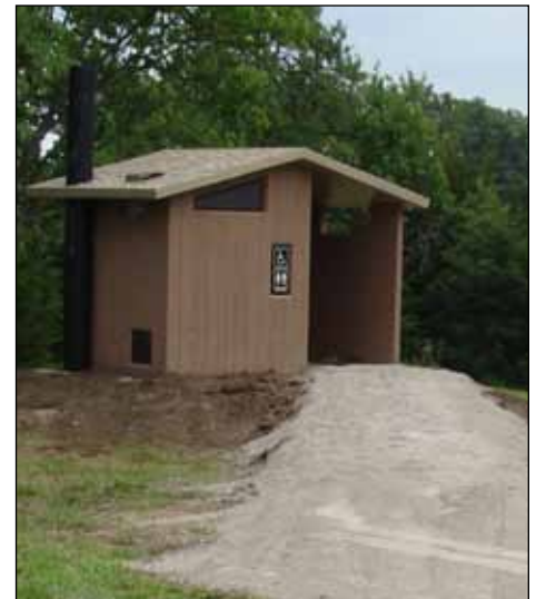
Two similar restrooms will be added at Kirkman's Cove this year.

After several dry years flooding has again become an issue on the trail. Missouri River levels have been high all spring because of above average releases