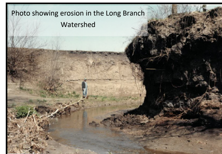
Photo showing erosion in the Long Branch Watershed

In the short time that the NRD's have been in existence I would say that we have made so many accomplishments, and I look forward to all the things that can be accomplished in the next 50 years.