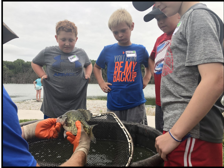
June 15, 2022

After a COVID induced hiatus the biennial "Watershed of Wonders" day camp was back this year and for the first time, was held at Duck Creek Recreation Area! Seventy, ten to twelve year olds from all across the Nemaha Natural Resources District (NNRD) participated in archery, fisheries education, fishing, boat safety, a boat