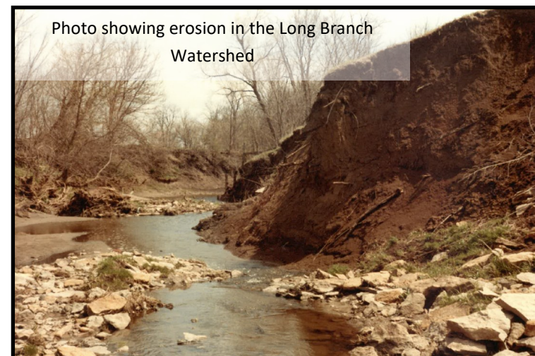
Photo showing erosion in the Long Branch Watershed