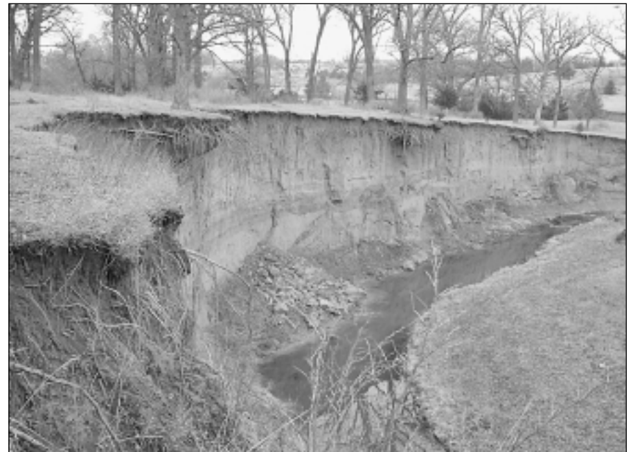
This is one example of the erosion caused by Muddy Creek near Johnson, NE.

The goal of this $1.25 million project is to construct 20 grade stabilization structures and 15 weir structures in the upper one-fifth of this watershed, located near the town of Johnson, Nebraska. Project objectives include the control of streambed and streambank erosion, preventing further damage to public infrastructure and utilities, improving water quality, and preventing the further loss of agricultural lands