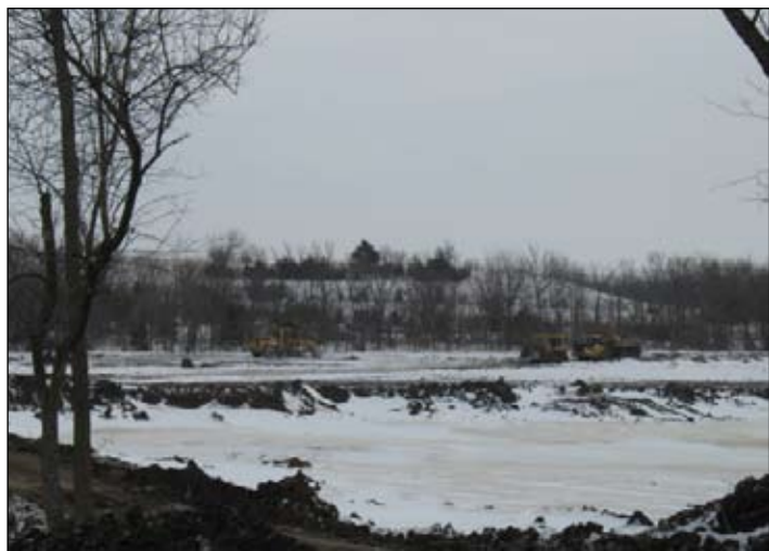
Excavation of the sediment basin at Iron Horse Trail Lake.

Flow meters allow the producer to know exactly how much water is being applied as well as the flow rate. As wells age, wear and tear decreases flow rates – a flow meter can identify a problem with the well, pump, or engine before major breakdowns occur. In addition, though meters are not required by law right now on high