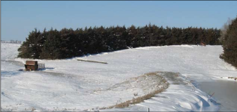
Windbreaks prove their worth this year.