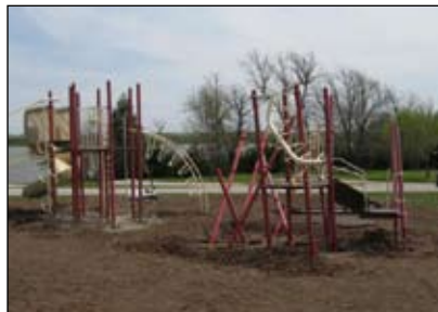
Assembly of new playground equipment at Kirkman's

The District has placed a high priority on getting Iron Horse Trail Lake open this summer, but there are a few upgrades in our other areas too. Kids visiting Kirkman's will be excited to find new playground equipment at the non-electric campground on the southwest area of the lake. If it looks familiar, the playground equipment was acquired from the school in Table Rock.