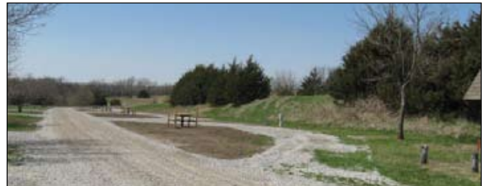
One of the new, electrical RV hookups