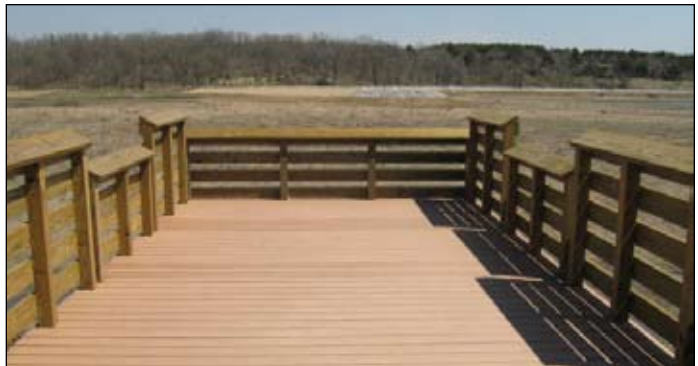
Accessible, wooden fishing pier near the boat dock