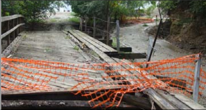
Bridge near Brownville scheduled for replacement this spring.

This time of year we start getting calls and emails about the status of the Steamboat Trace. The trail has been open for use, but work is still under way to repair damage to the trail surface and bridges. During the next few months, the NRD will be repairing two bridges in the Brownville area. There are no plans to close the trail while this work is going on; however, users could expect some short detours. The Missouri River is running bank-full again this year, so the trail will be subject to flooding. River levels are impacted by releases from Gavin's Point Dam and runoff from the river basins between Yankton, South Dakota, and southeast Nebraska. It appears that releases from Gavin's Point will be high for the entire year, so the potential for flooding on the trail is higher than normal. Those interested in using the trail may want to check the NRD website or contact the NRD prior to using the trail, particularly if there have been heavy rainfall events in western Iowa or eastern Nebraska.