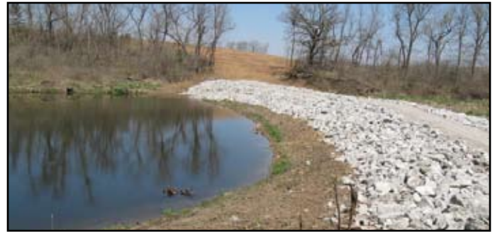
Sediment basin created at upper reaches of the lake

Mark your calendars and watch your local news for more details about the upcoming grand “reopening” of Iron Horse Trail Lake on June 25!