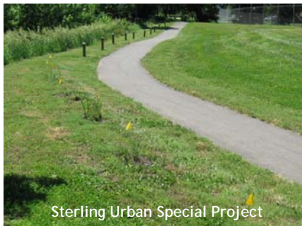
Sterling Urban Special Project

In 2009-2010 the Nemaha NRD provided grants to the communities of Falls City in Richardson County and Sterling in Johnson County to enhance their outdoor recreation areas.