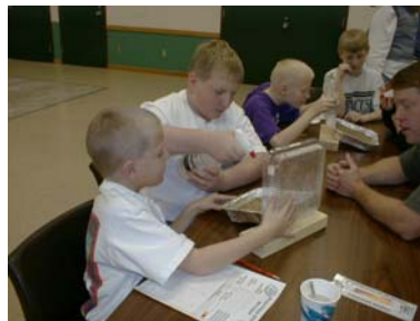
Water Celebration @ Peru State College

To help our youth grow into knowledgeable adults, the Nemaha NRD sponsors or assists with programs that include the 5 th grade Water Celebration at Peru each spring, Envirothon/Land Judging/Range Judging competitions for high school students, Watershed of Wonders day camp for 10-12 year olds, and 3 rd grade Plant-A-Tree program each spring. NRD staff visit schools and help with hands-on workshops upon request.