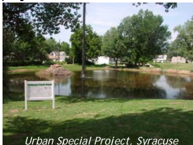
Urban Special Project, Syracuse

Annually the Nemaha NRD provides part of the cost for a variety of programs that enhance, improve, and protect people and their property. The District funds conservation measures such as terraces, waterways, small dams, grass seeding, tree planting, and educational or recreational projects in urban areas. Wells that are no longer used and have, therefore, become a threat to water quality and/or people and animals are properly closed using funding from NRD and state sources.