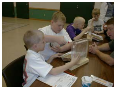
Water Celebration @ Peru State College

To help our youth grow into knowledgeable adults, the Nemaha NRD sponsors or assists with programs that include the 5 th grade Water Celebration at Peru each spring, Envirothon/Land Judging/Range Judging competitions for high school students, Watershed of Wonders day camp for 10-12 year olds, and 3 rd grade Plant-A-Tree program each spring. NRD staff visit schools and help with hands-on workshops upon request.