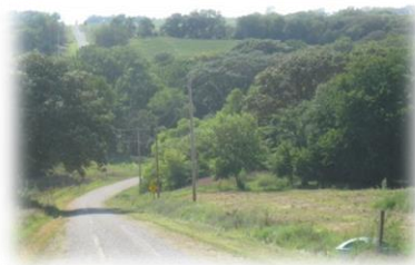
When complete the Duck Creek dam & recreation area will sit north of this road (right side of photo).

Land rights acquisition and plans for road upgrades are moving along as the NRD continues to progress on the Duck Creek watershed project near Peru, Nebraska, in Nemaha County. The multi-purpose project will provide needed protection to county roads, bridges, and cropland while incorporating public recreation opportunities. Much of the funding for the $1.2 million dam will come from the federal PL566 watershed fund.