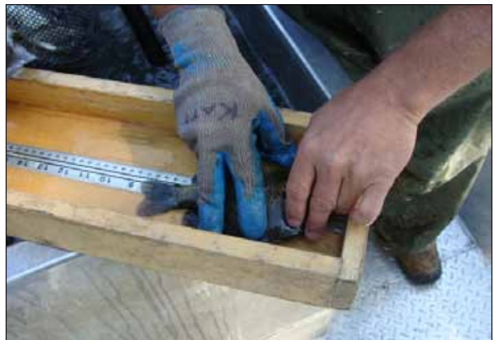
Game & Parks staff measure this fish captured at Iron Horse Trail Lake in May.

Results from recent fishing tournaments and anecdotal reports appear to be similar to the Game and Parks evaluation. The largest Largemouth Bass captured or reported has been 20 inches. A 21-inch minimum limit is set for keeping bass at Iron Horse. A minor Bluegill kill this spring appears to be due to a fungus, and Game and Parks fisheries staff feels it should not impact the lake's population.