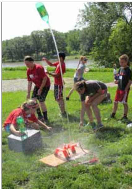
Water rockets @ 2014 Watershed of Wonders

To date more than 50 kids have signed up, but we still have room. Pre-registration is required, and the form is available on our website ( www.nemahanrd.org ). The initial deadline for registrations has passed, but we'll keep receiving them as long as possible. Signed permission/liability forms must be provided on or before the event in order to participate. For more information, please call our office (402) 335-3325.