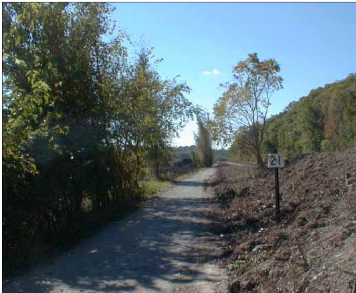
Drainage work and sections of paving are planned for this area of the Steamboat Trace.

Grant funds from the federal Recreational Trails Program are providing 80 percent of the engineering and construction costs.