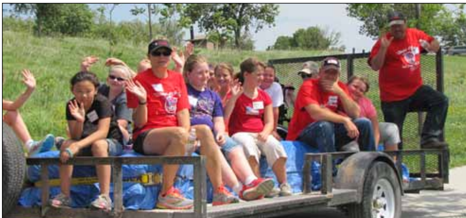
Taking a ride on the rack @ 2014 Watershed of Wonders