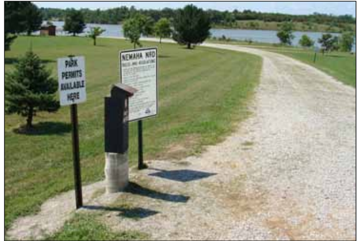
Vehicle entry permit envelopes are available in these iron boxes at each of the parks.