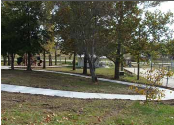
This trail project was completed last year in Unadilla with help from the NRD's Urban Special Projects program.

Three of this year's applicants were schools who will be incorporating various types of outdoor classroom situations into their landscapes. Auburn Public Schools will receive $25,000 toward a $268,002.80 project to build a greenhouse for their agricultural/biology programs. Johnson-Brock Public Schools receives $24,400 toward a $48,800 project to develop the school's courtyard into an outdoor classroom. A joint project with the Lewiston Public School and its FFA chapter will develop