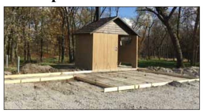
The contractor prepares to pour concrete for restrooms at Duck Creek Recreation Area.

Other major improvements completed over the past few months include the installation of five precast, concrete vault