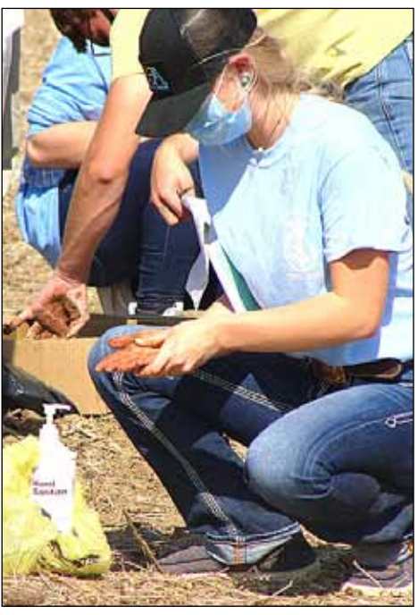
Face coverings and hand sanitizer were common components of this year's Area Land Judging Contests.

Though not your typical contest, the weather was ideal; and both students and adults enjoyed the opportunity to participate. Thanks to everyone who helped make this event possible.