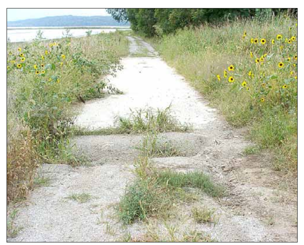
Some sections of the Steamboat Trace will require more work than others before reopening to the public.