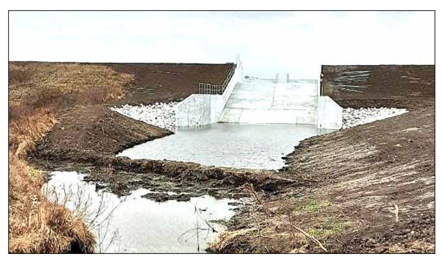
Seeding remains to be done around the newly constructed concrete spillway through the dam at UBN 25-C.