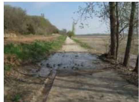
Impacts from the county road (left) above the trail (right) will be addressed during renovations.

The hiking and bicycling community will benefit from renovations to a two-mile stretch of the Steamboat Trace trail. Resurfacing problem areas with concrete paired with drainage improvements will provide a smoother surface and alleviate some of the erosion concerns experienced in this area. The site under repair is between Honey Creek and Weldon Creek (approximately mile markers 19 to 22 between Peru and Brownville). Kreifels Conservation & Excavating, Nebraska City, is expected to complete the work around the end of September, 2016.